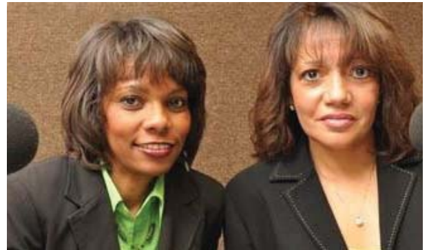
Hosts of the Small Business Exchange (SBE) Talk Radio